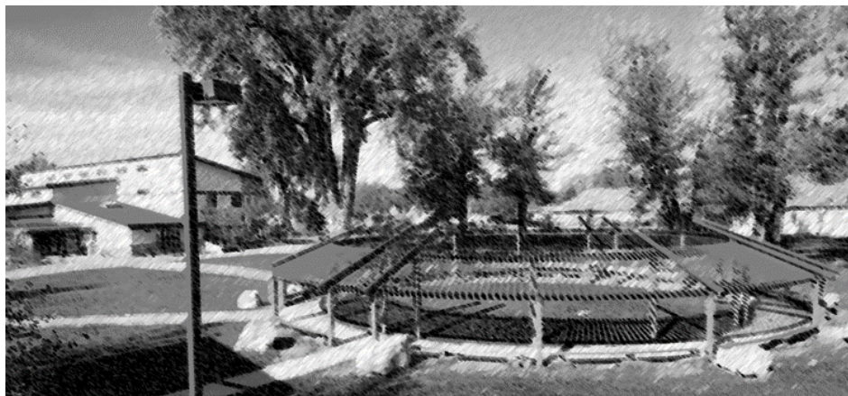
Little Big Horn College Arbor

Tutors are trained to assist students in academic areas such as mathematics, physical science, social science, and writing. Students may request a tutor for their courses through the Title III Program (SUB 211), Student Success Center (SUB 100), or the course instructor. Tutoring is offered free of charge and for all courses to LBHC students.